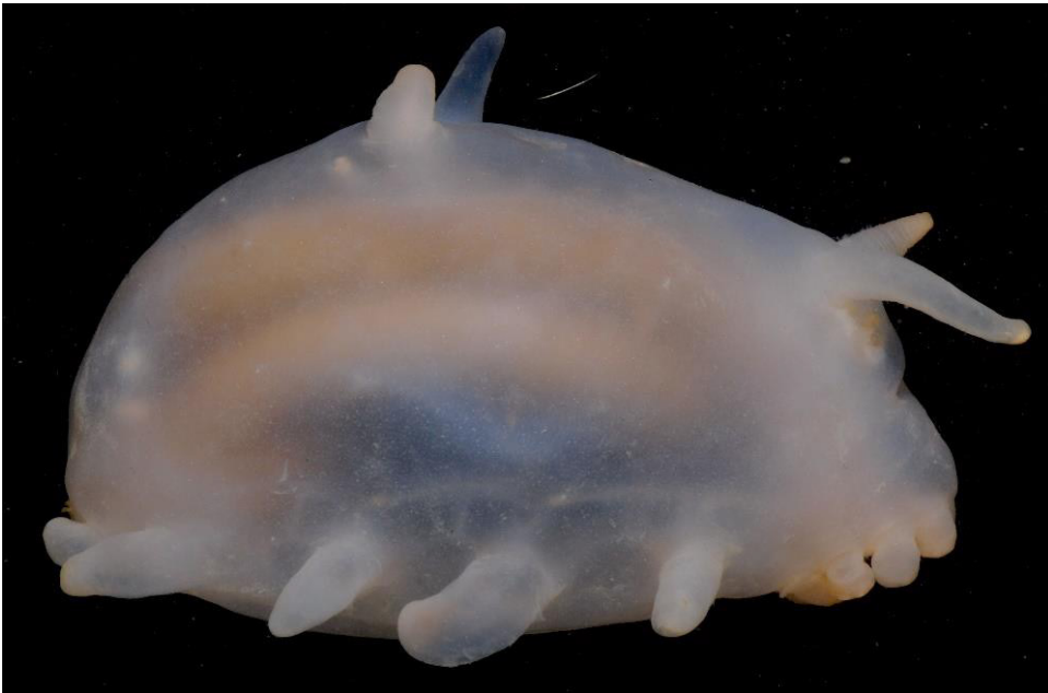
Antarctic sea pig Protelpidia murrayi