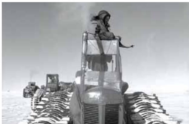
Left: Sir Edmund Hillary on a Ferguson tractor, leaving Depot 48 on his way to the South Pole (Dec 1957)

If you’d like to find out all about the history of Scott Base and New Zealand’s scientific presence in Antarctica, as well as keeping up-to-date with all the upcoming Anniversary events, then check out our Scott Base Anniversary website: www.scottbase50years.co.nz